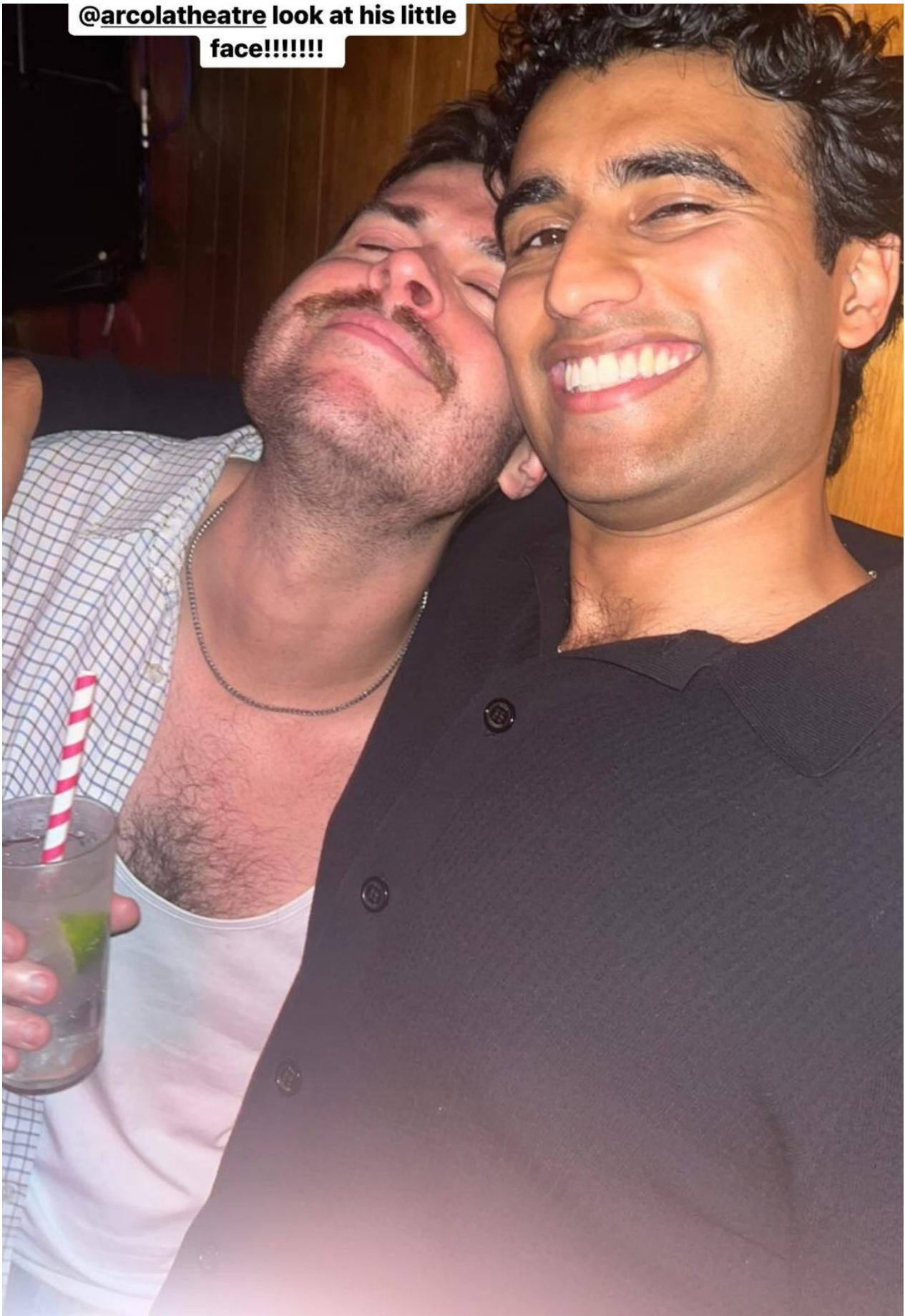
@arcolatheatre look at his little face!!!!!!